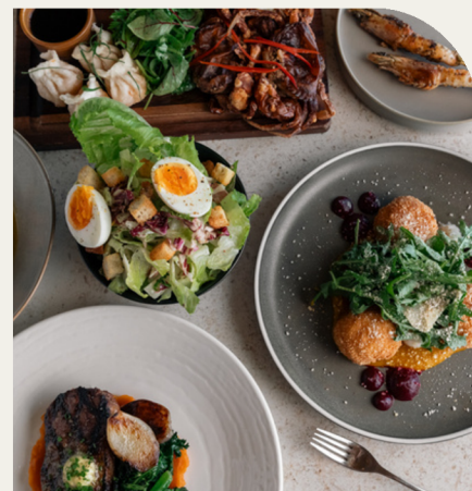
Lunch at Balgownie Estate

Begin your Yarra Valley escape with wine tastings at Balgownie Estate. Follow it with a relaxed lunch featuring locally inspired seasonal dishes.