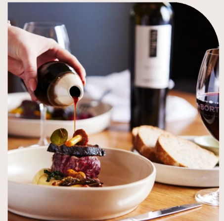
Lunch at De Bortoli

Pick up fresh provisions from Yarra Glen or Healesville for a picnic lunch at Glenlowren or in a picturesque spot nearby, like Maroondah Dam or Badger Weir.