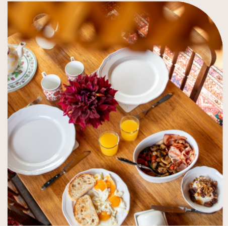
Breakfast at Glenlowren

Start the day with a leisurely breakfast from your provided provisions, then explore Glenlowren's scenic walks around the farm.